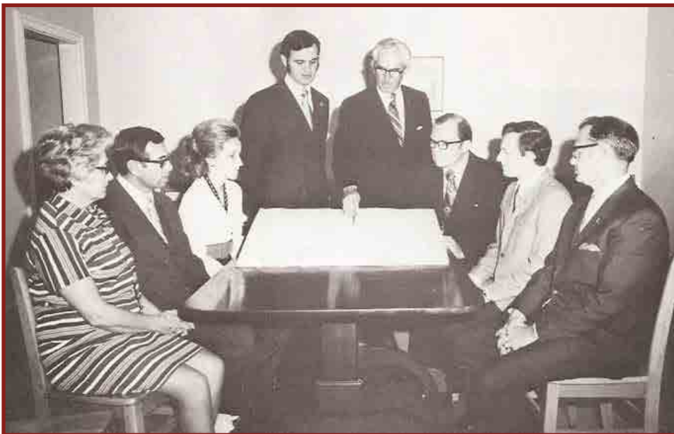
The Dream Team: The Building Committee for the 1972 Education Building.