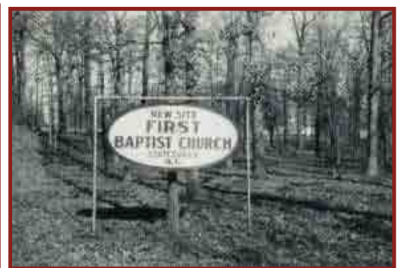
Site of current building