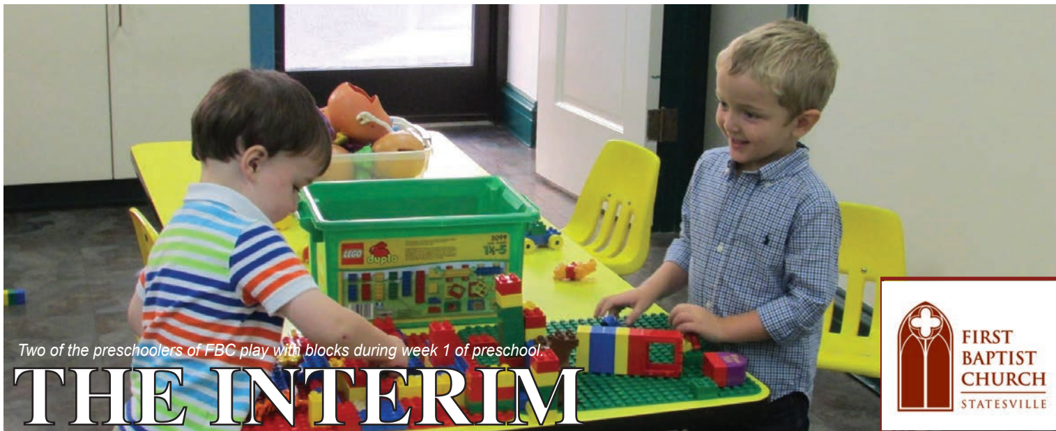
Two of the preschoolers of FBC play with blocks during week 1 of preschool.