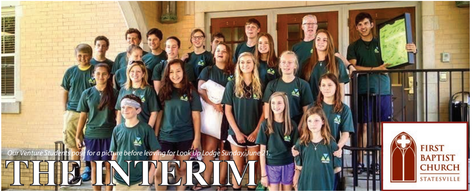
Our Venture Students pose for a picture before leaving for Look Up Lodge Sunday, June 21.